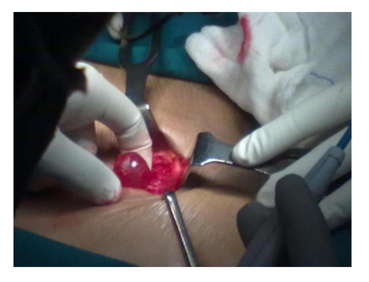
Figure 4. 35 year old female diagnosed with right sided hydrocele of the canal of Nuck. This intra operative image shows the hydrocele being held up by the surgeon.