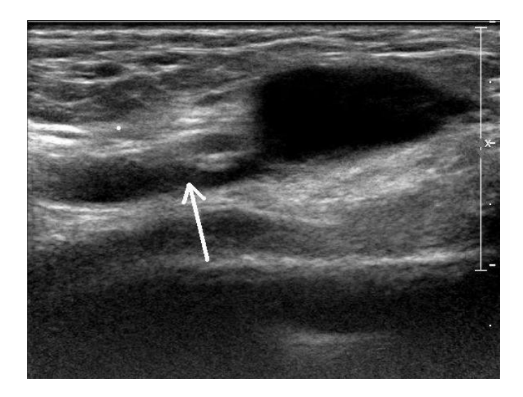
Figure 2. 35 year old female diagnosed with right sided hydrocele of the canal of Nuck. Longitudinal ultrasonographic image using high frequency linear transducer (L17-5MHz) showing patent and partially compressed canal of Nuck (arrow) with an anechoic cystic structure measuring 4.3 \times 2.6 cms in size.