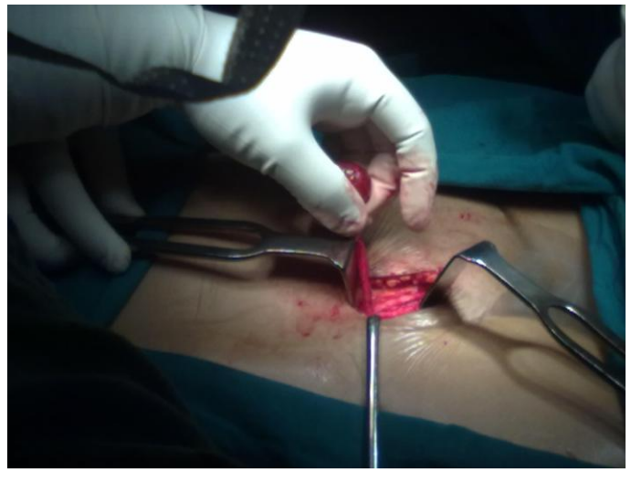
Figure 5. 35 year old female diagnosed with right sided hydrocele of the canal of Nuck. This intra operative image shows the hydrocele of the canal of Nuck separated from the round ligament.