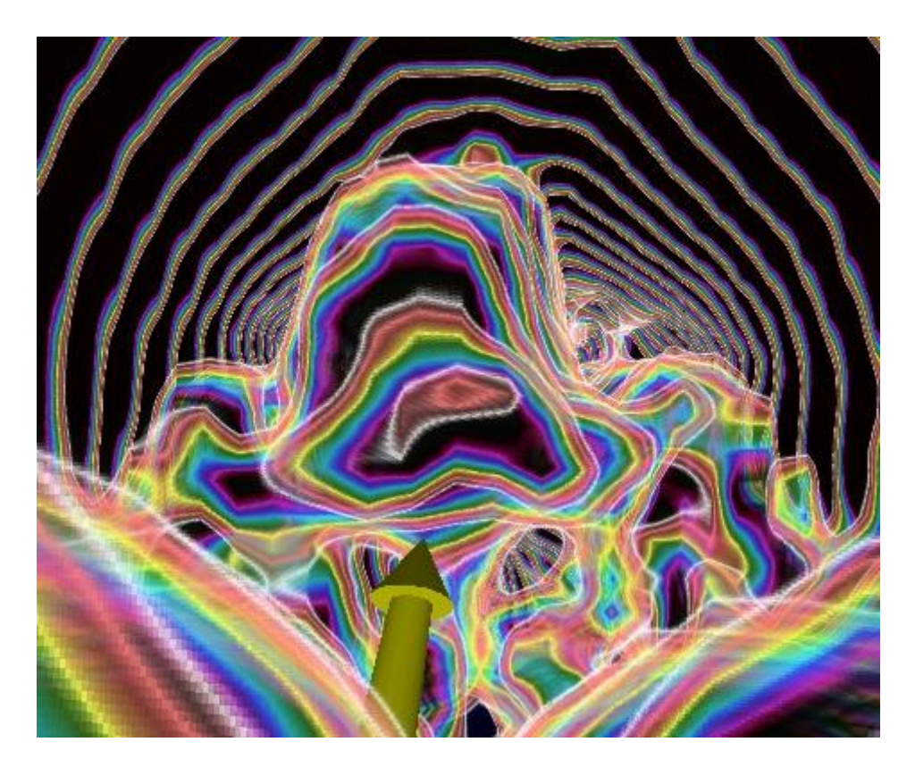
Artistically rendered 3D reconstructed view of the roof of the 4th ventricle showing a 3D arrow pointing towards the nodule of the cerebellum.

URL of this article: www.radiologycases.com/index.php/radiologycases/article/view/751