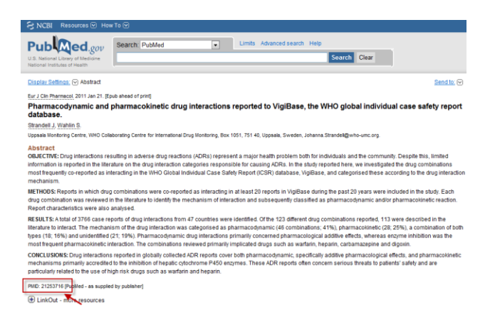
Figure 1. How to get the PubMed ID for an article: The PubMed ID is located to the left bottom of the abstract and displayed in the format "PMID: #", with "#" being the PubMed ID (red box and arrow). URL: www.pubmed.org