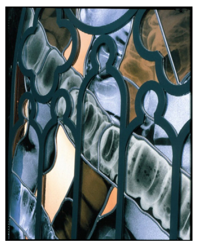
Figure 2: September detail, 2001, 244 x 104 cm, steel, X-rays, lead, glass, collection Katoen Natie, Antwerp (detailed view)

URL of this article: www.radiologycases.com/index.php/radiologycases/article/view/38