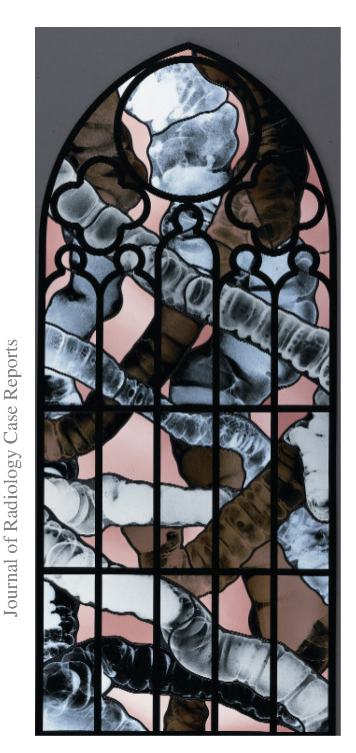
Figure 2: September detail, 2001, 244 x 104 cm, steel, X-rays, lead, glass, collection Katoen Natie, Antwerp