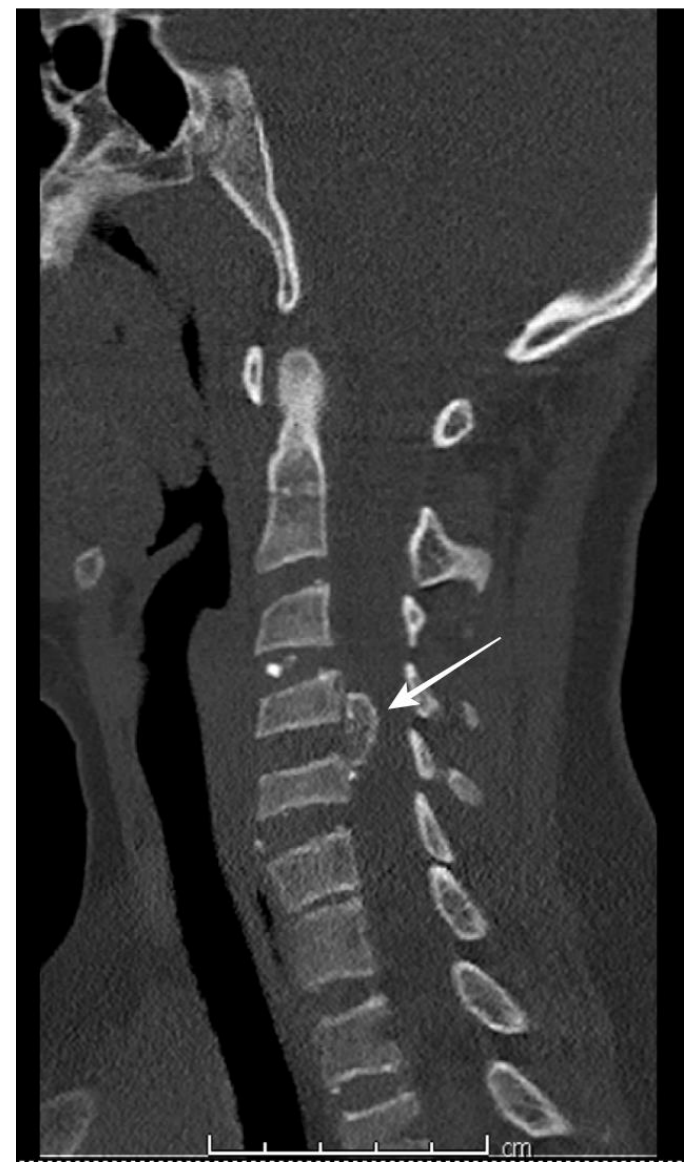
Figure 3: 8-year-old male with intervertebral disc calcification and Klippel-Feil Syndrome

Technique: Phillips Ingenuity CT, 332 mAs, 100 KVp, helical 0.9mm axial slices, non-contrast