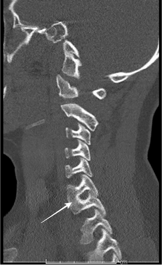
Figure 4 (left): 8-year-old male with intervertebral disc calcification and Klippel-Feil Syndrome

Findings: Additional sagittal view demonstrates left-sided mild, incomplete vertebral body and posterior elements segmentation of C6-C7 as indicated by the arrow consistent with KFS