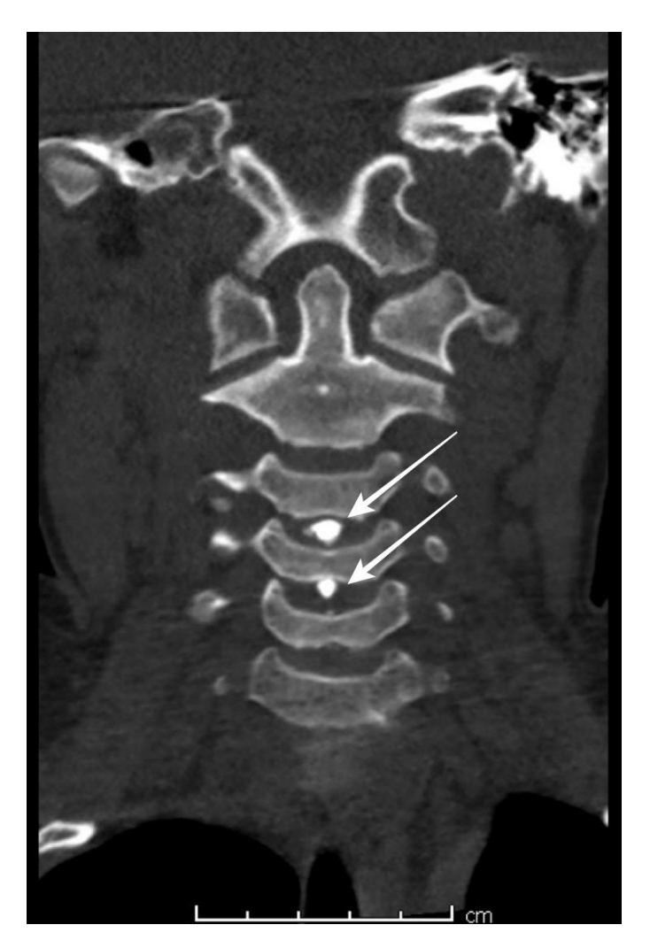
Figure 2: 8-year-old male with intervertebral disc calcification and Klippel-Feil Syndrome

Findings: Coronal view demonstrates arrows indicating intervertebral disc nucleus pulposus calcification at C3-C4 and C4-C5 \,