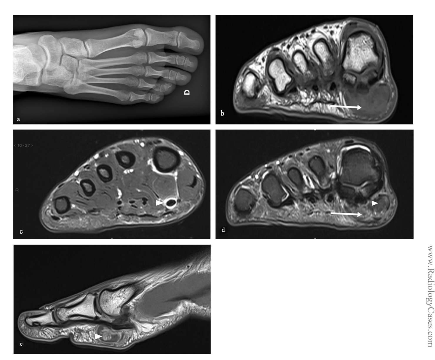
Figure 3: 35-year-old man with adventitious bursitis of the forefoot.

Findings: a Conventional antero-posterior radiograph of the right foot showing no abnormalities. b-d: MRI of the forefoot demonstrating a well-delineated mass developed below the first metatarso-phalangeal joint. b Coronal T1-weighted showing an intermediate signal-intensity mass. c Coronal fat-saturated T2-weighted images showing a tenosynovitis of the flexor hallucis longus (arrowhead) d Coronal fat-saturated T2-weighted images showing a heterogenous mass with high (straight arrow) and low signal intensity (arrowhead). e Sagittal gadolinium-enhanced T1-weighted MR image showing a partial nodular enhancement of the mass (arrowhead).