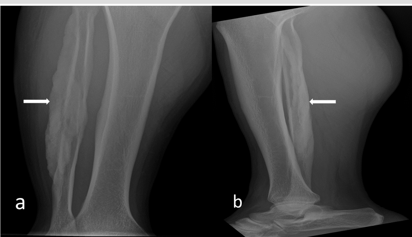
Figure 1: 28-year-old male with melorheostosis.

Findings: (a, b) Anteroposterior and lateral radiographs of the right leg show sclerosis on the posterior lateral aspect of the proximal two-thirds of the fibula with periosteal and endosteal cortical thickening, consistent with the classic dripping wax appearance (arrows).