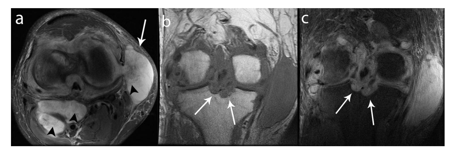
Figure 2: 41-year-old male with right knee pain and soft tissue mass due to sporotrichosis osteoarticular infection. FINDINGS: 3 Tesla MRI without contrast demonstrates large fluid collection. Axial T2 FS sequence (a) demonstrates fluid collection that communicates with a parameniscal cyst (long white arrow) and contains synovial thickening (black arrowheads). Coronal T1 (b) and coronal T2 FS (c) sequences demonstrate the large fluid collection with erosions of the tibia and femur (short white arrows). Axial T2 FS, Coronal T1, and Coronal T2 FS sequences also demonstrate complex tear of the menisci with large meniscal defect through which the paramensical cyst communicates with the joint. MRI Technique: 3T Axial T2 with fat saturation (TR: 5742, TE: 51.52); 3T Coronal T2 with fat saturation (TR: 4796, TE: 39.1); 3T Coronal T1 (TR: 617, TE 10.66); no intravenous contrast.