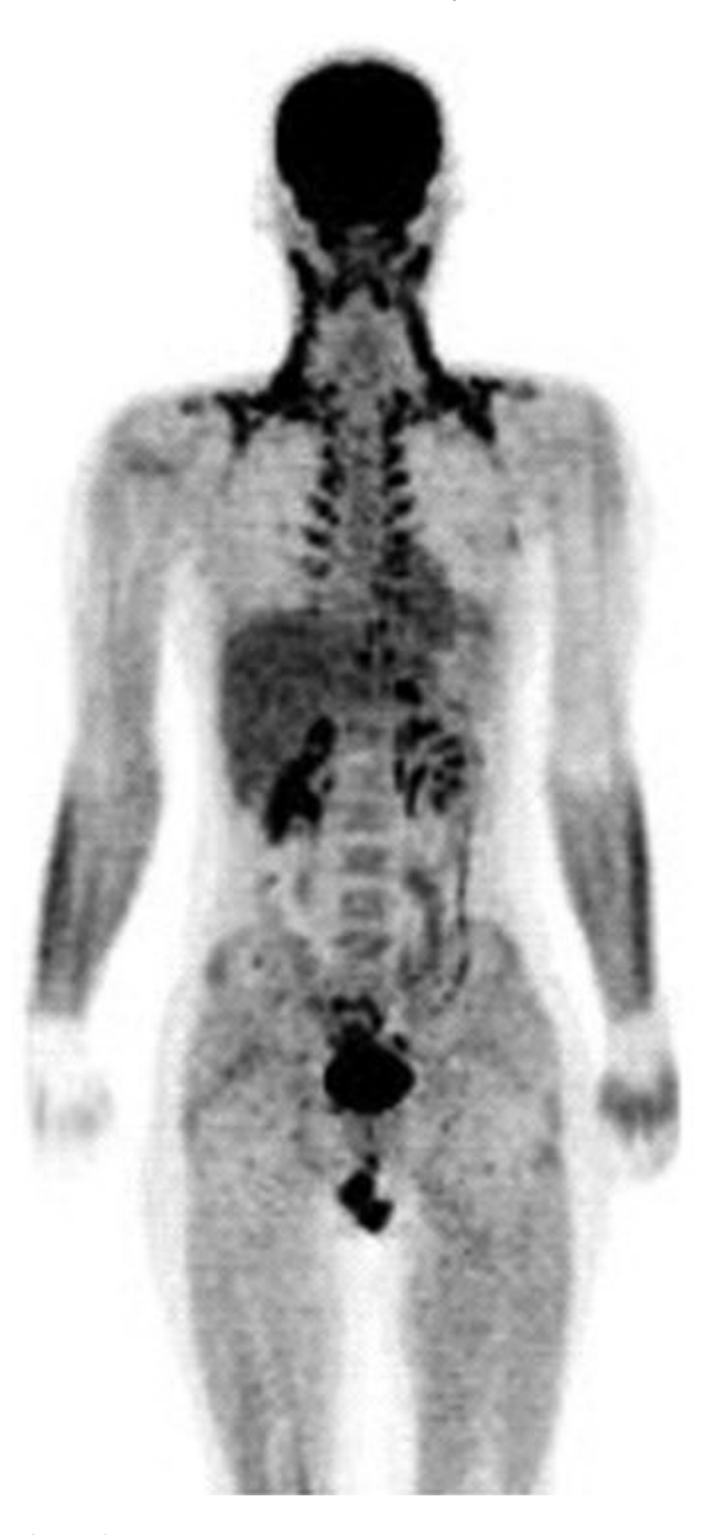
Figure 2: Typical pattern of FDG uptake in the brown adipose tissue: avid bilateral and symmetric, intense, more often multifocal than linear and distributed over neck, supraclavicular and paravertebral region.