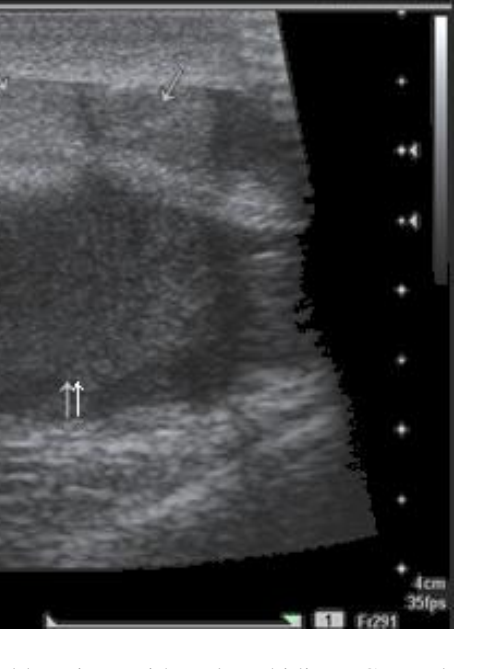
LT SCROTAL SAC Figure 2. 13 year old patient with polyorchidism. (a) Power doppler (linear probe, 5.3 MHz) image of right testis. (b) Power doppler (linear probe, 5.3 MHz) of left hemiscrotum showing colour flow in both the testicles.