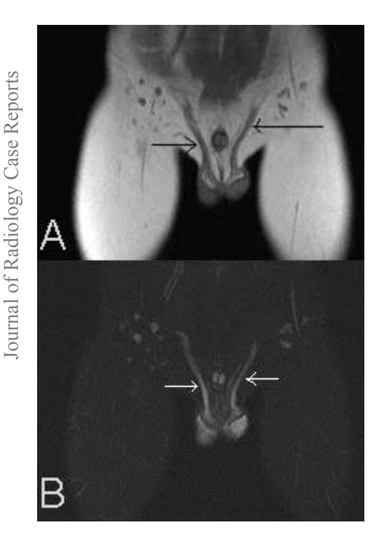
Figure 4. 13 year old patient with polyorchidism. (a) T1 weighted image (0.35T, TR-583, TE-21) & (b) Fat suppressed weighted image (0.35T, TR-4600, TE-64, TI-110) showing two separate spermatic cord.