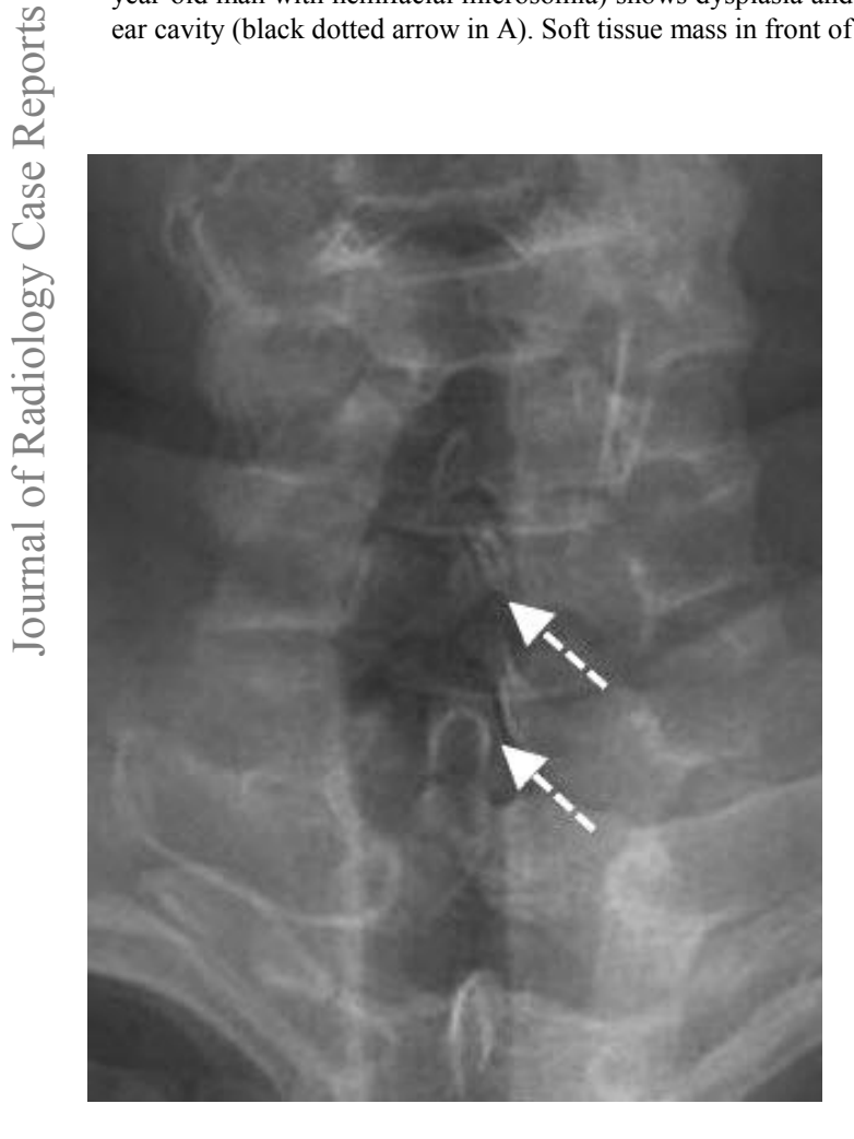
Figure 4: AP radiograph of the cervical spine in a 46 year-old man with hemifacial microsomia demonstrating missing posterior fusion of the vertebral arch C6 and C7 (white dotted arrows).