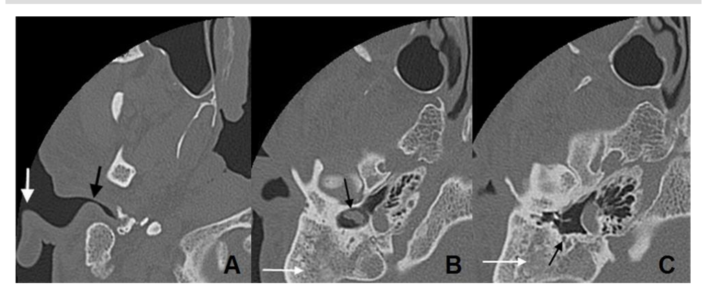
Figure 1: Axial computed tomography images in a 46 year-old man with hemifacial microsomia (native, 120kv/120mAs):

A: Stenosis of the external auditory canal (black arrow) and dysplasia of the auricle (white arrow).