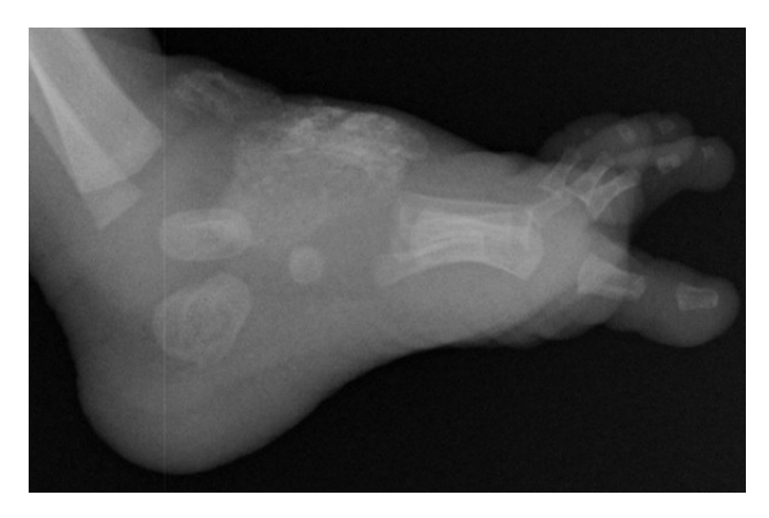
Figure 2: Lateral radiograph obtained one month later demonstrates progression of the mineralization and size of the mass.