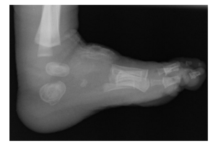
Figure 1: Initial lateral radiograph of the foot demonstrating an amorphous mineralized mass in the dorsal soft tissues.