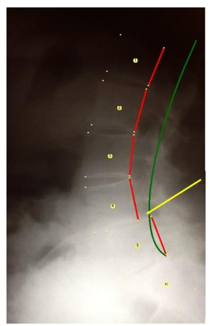
Figure 1: 69-year-old female with low back pain (LBP) and a grade 2 spondylolisthesis.

Findings: Pre-treatment LL x-ray. LL projection demonstrates a grade 2 L4-L5 spondylolisthesis measuring 13.3 mm of anterior translation of L4 on L5 perpendicular from the posterior tangent of the L5 vertebral body to the posterior tangent of the L4 vertebral body.