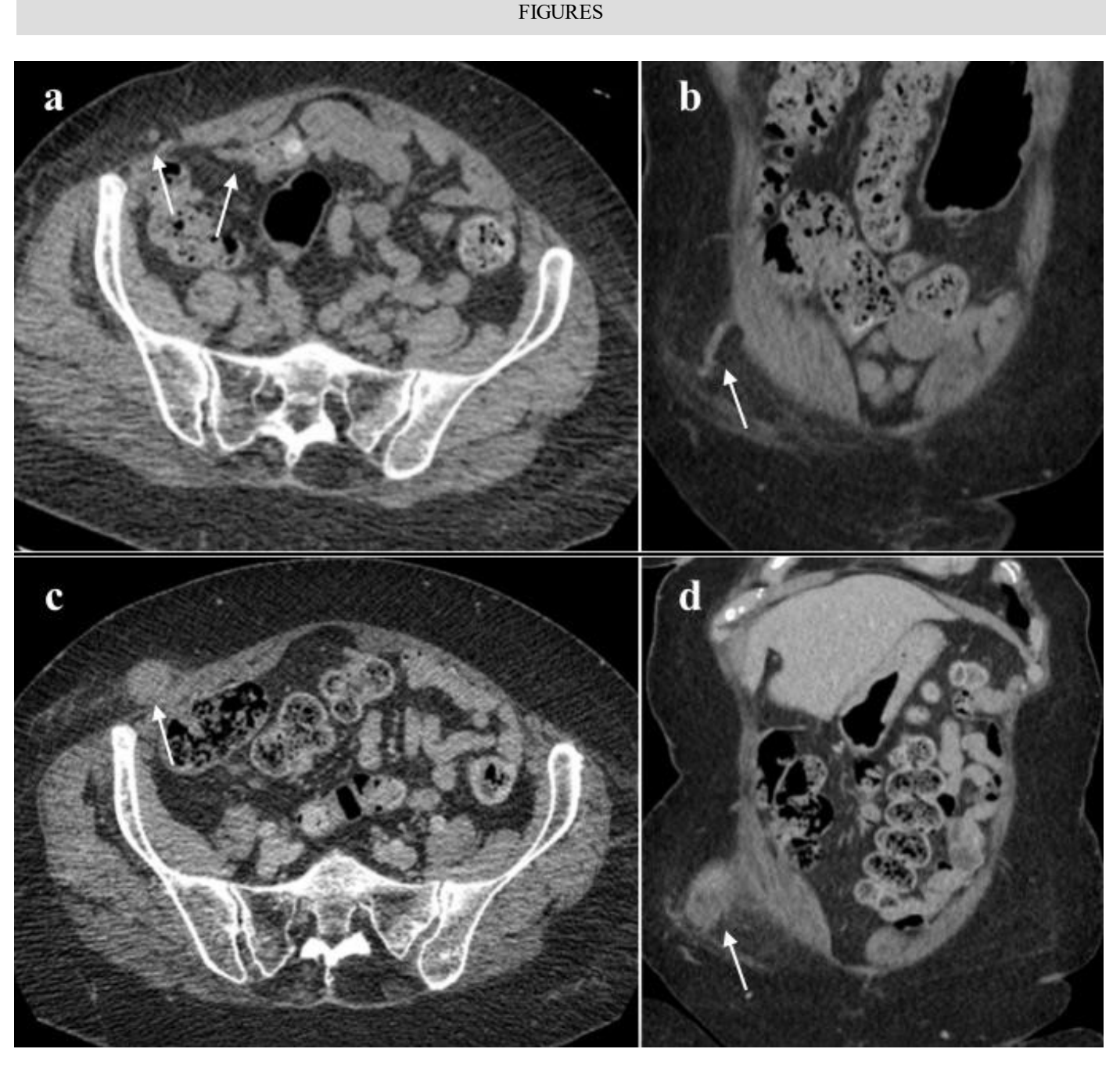
Figure 1: 74 year old female with Spigelian hernia; herniated appendix (a and b) and incarcerated appendix (c and d). FINDINGS:

(a and b) Axial and coronal non-contrast enhanced CT images of the abdomen at initial patient presentation demonstrate a very thin tubular structure with base at the cecum and tail extending into the subcutaneous fat.