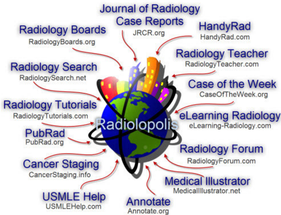
Figure 1: Multiple programs for educational and clinical practice has been implemented into Radiopolis . Radiopolis is a Radiology community, combining multiple educational and clinical programs, where residents, radiologists and Radiology technologists from all over the world connect to peers, find information and share their knowledge with their colleagues.