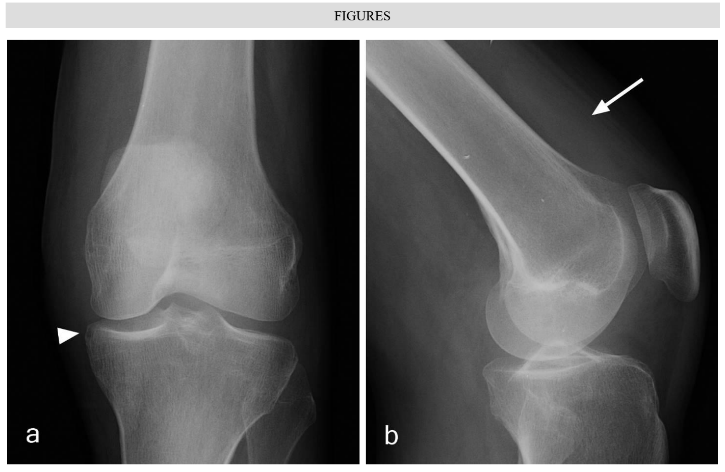
Figure 1: 41-year-old woman with Mycobacterium kansasii synovitis and osteomyelitis of the knee. Findings: Anterior-posterior (a) and lateral (b) radiographs of the left knee performed on the patient's initial visit to the emergency department demonstrate a tiny medial marginal tibial erosion (arrowhead), and synovial effusion (arrow). Technique: kVp and mAs were not recorded.