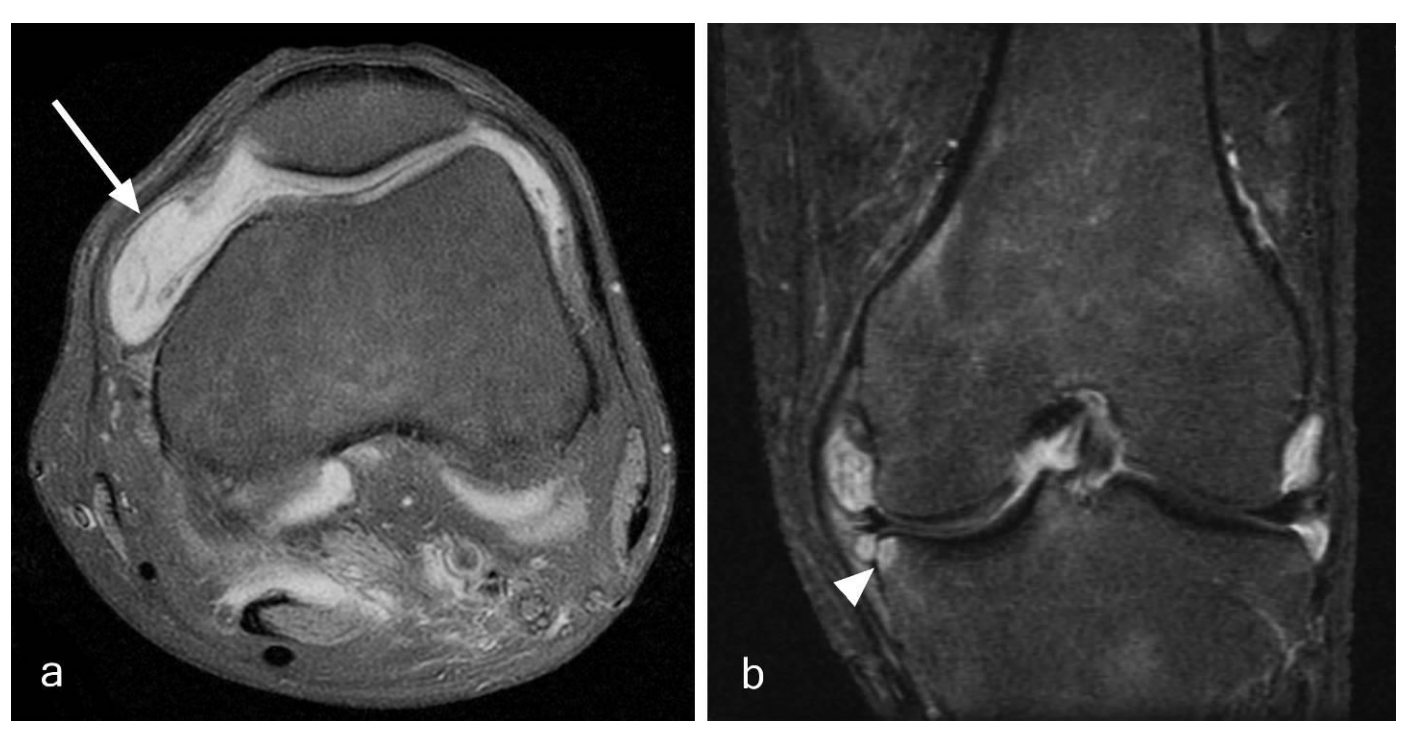
Figure 2: 41-year-old woman with Mycobacterium kansasii synovitis and osteomyelitis of the knee. The MR examination of the left knee was performed three months after the initial radiographs (Figure 1).

Findings: Non-contrast axial fat-suppressed proton density (PD) (a) and coronal short tau inversion recovery (STIR) (b) images of the left knee demonstrate synovial thickening with effusion (arrow) and hyperintense STIR signal in the bone marrow of the medial tibia (arrowhead) in the area of the tiny erosion seen on the radiographs from three months earlier.