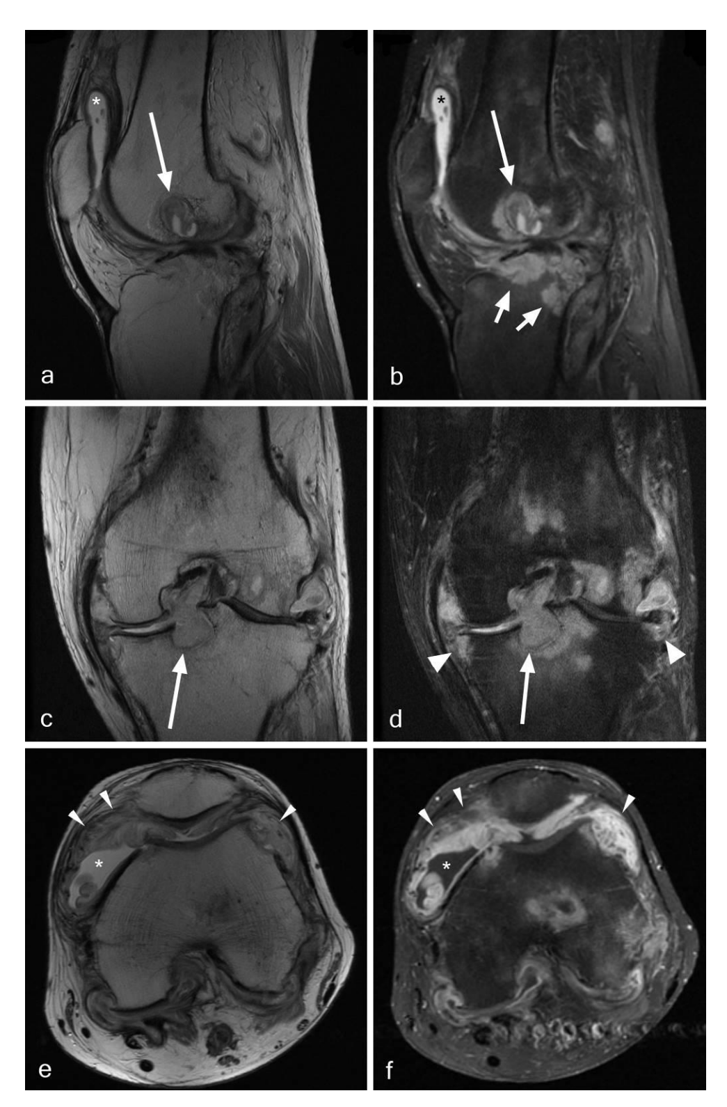
Figure 4: 48-year-old woman with Mycobacterium kansasii synovitis and osteomyelitis of the knee. MR examination of the left knee was performed seven years after the initial MRI (Figure 2). Intravenous gadolinium contrast was administered prior to figure 4f.

Findings: Sagittal, coronal, and axial PD (a, c, e), sagittal and coronal PD with fat suppression (b, d), and axial post-contrast T1weighted fat-suppressed (f) images demonstrate large subarticular erosions (long arrows) with heterogeneously decreased signal on proton density (a) and increased signal on fluid sensitive images (b, d) compared to bone marrow, as well as marginal erosions with fluid sensitive hyperintensity (wide arrowheads d). There is nodular synovial thickening with contrast enhancement (narrow arrowheads e, f), and a joint effusion (asterisks a, b, e, f). Bone marrow edema is also seen (short arrows b).