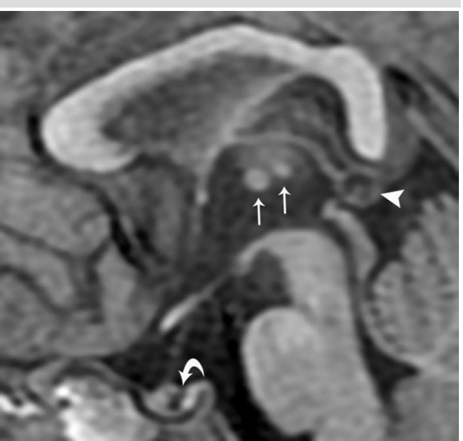
Figure 1: 14-month-old female with duplication of the massa intermedia. FINDINGS: Sagittal T1WI demonstrates two distinct round structures in the 3rd ventricle (straight arrows) representing duplication of the massa intermedia. The anterior massa intermedia measures 3 \times 3 \times 3 mm while the posterior MI measures 2 \times 2 \times 2 mm. Small pineal cyst (arrow head) and intrasellar pars intermedia cyst (curved arrow) are incidentally present. TECHNIQUE: 1.5T MR (General Electric, Milwaukee, WI). Sagittal midline T1 Fast Spoiled Gradient Echo (FSPGR) image (TR/TE/IT = 11/2/500).