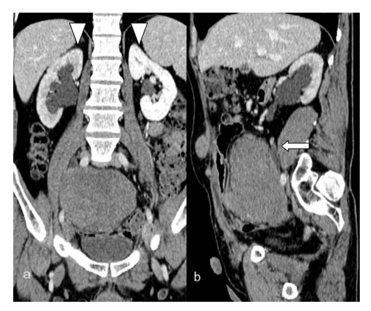
Figure 4: Coronal (a) and sagittal (b) multiplanar reconstruction (MPR) multidetector CT staging to evaluate response to chemotherapy demonstrated, during portal phase, increase in size of the mesenteric mass compromising the right ureter ( arrow in figure b) causing a hydronephrosis with reduced renal cortical enhancement of the right kidney (arrowheads in figure a). (Imaging parameters: 5 mm slice thickness; 120kv; variable mA with automatic exposure control, this level 160 mA)