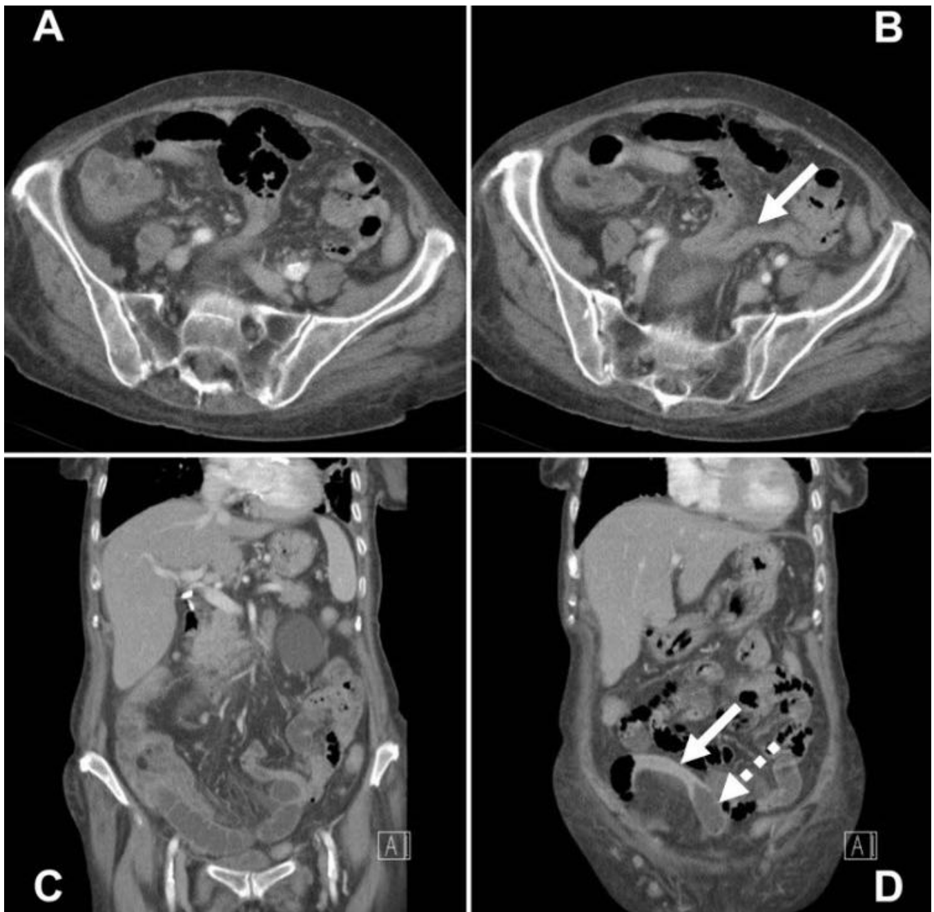
Figure 2: 81 year old woman with gastrointestinal amyloidosis presenting as enterocolitis on abdominal CT scan. Axial (A and B) and coronal (C and D) multiplanar reformatted computed tomography images show wall thickening of several segments of the small intestine (arrow in B) with high grade stricture (arrow in D) and prestenotic dilations (dotted arrow in D).