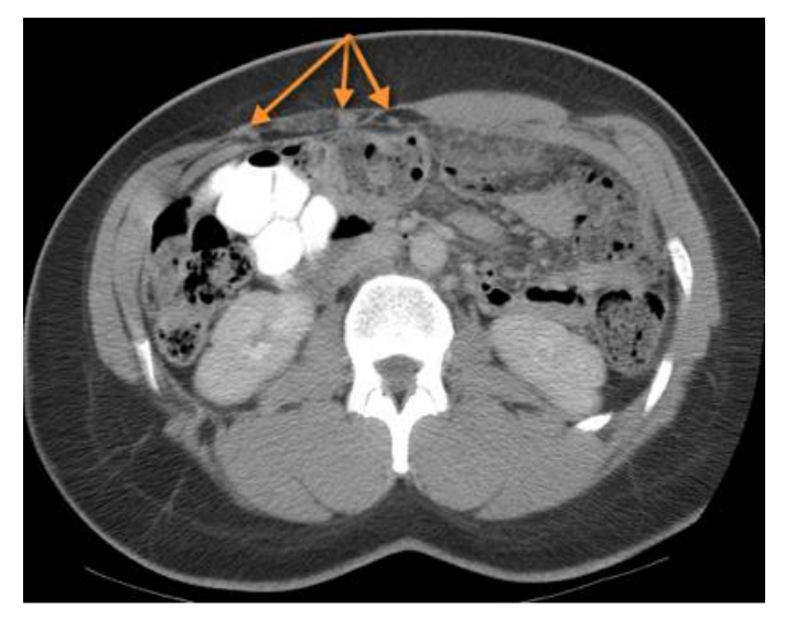
Figure 3: 37 year old female with catamenial pneumothorax. Axial CT of the abdomen shows multiple nodular densities located within the omentum (yellow arrows). These were biopsy proven endometrial implants.

Axial image of CT Chest without contrast in mediastinum window. KV=120. Slice thickness: 3mm