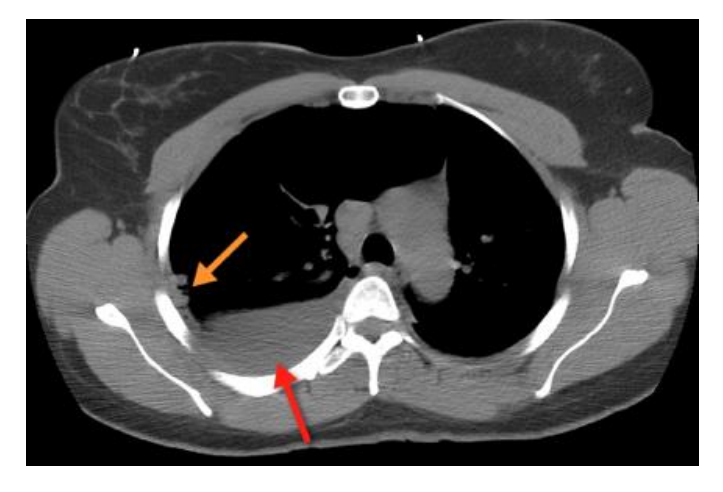
Figure 2: 37 year old female with catamenial pneumothorax. Follow up axial CT in soft tissue windows demonstrates pleural nodules (yellow arrow) which were biopsy proven endometrial implants. Red arrow demonstrates a unilateral right sided pleural effusion, which measured 35 hounsfield units.

Axial image of CT Chest without contrast in mediastinum window. KV=120. Slice thickness: 3mm