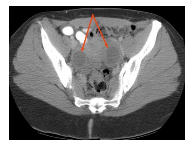
Figure 4 (left): 37 year old female with catamenial pneumothorax. Axial CT of the abdomen/pelvis with oral and IV contrast shows bilateral cystic adnexal masses (orange arrows). These were biopsy proven to be "chocolate cysts" compatible with endometriosis of the bilateral ovaries.

Axial image of CT pelvis without IV contrast, with oral contrast (1000cc of Gastrograffin) in abdominal window. KV=120. Slice thickness: 5mm