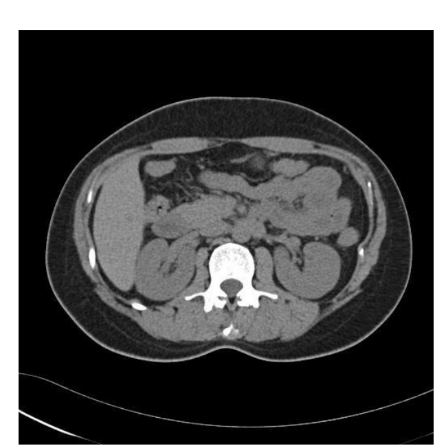
Figure 1: Computed Tomography Noncontrast CT of the abdomen was negative for stones or hydronephrosis.

5. Rabinowitz CB, Egglin TK, Beland MD, Mayo-Smith WW. Outcomes in 74 patients with an appendicolith who did not undergo surgery: is follow-up imaging necessary? Emerg Radiol. 2007 Jul;14(3):161-5. Epub 2007 Apr 25