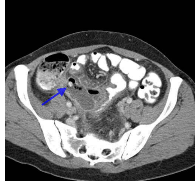
Figure 3: Computed Tomography

Contrast enhanced axial CT of the abdomen demonstrates dilatation and inflammation of the appendix with surrounding soft tissue stranding. Gas bubbles are seen within and outside the appendiceal lumen, medial to the cecum, consistent with perforated appendicitis. The previously seen 1 cm fecolith is again identified in the proximal appendix (arrow).