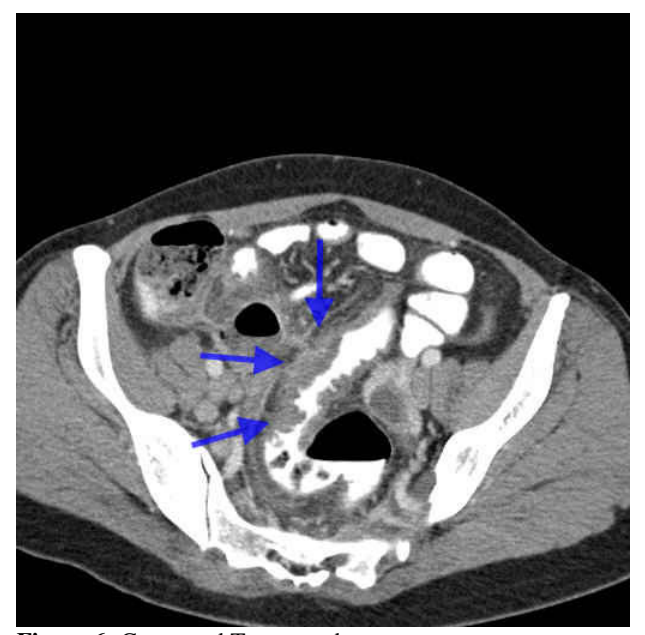
Figure 6: Computed Tomography Contrast enhanced axial CT of the abdomen demonstrates circumferential focal wall thickening of the distal sigmoid (arrows) which is affected by the inflammatory changes of the appendix.

URL of this article: www.radiologycases.com/index.php/radiologycases/article/view/27