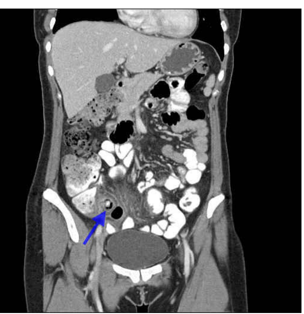
Figure 4: Computed Tomography Contrast enhanced coronal reformatted CT of the abdomen demonstrates dilatation and inflammation of the appendix with surrounding soft tissue stranding and gas bubbles within and outside the appendiceal lumen, medial to the cecum, consistent with perforated appendicitis. The previously seen 1 cm fecolith is again identified in the proximal appendix (arrow).